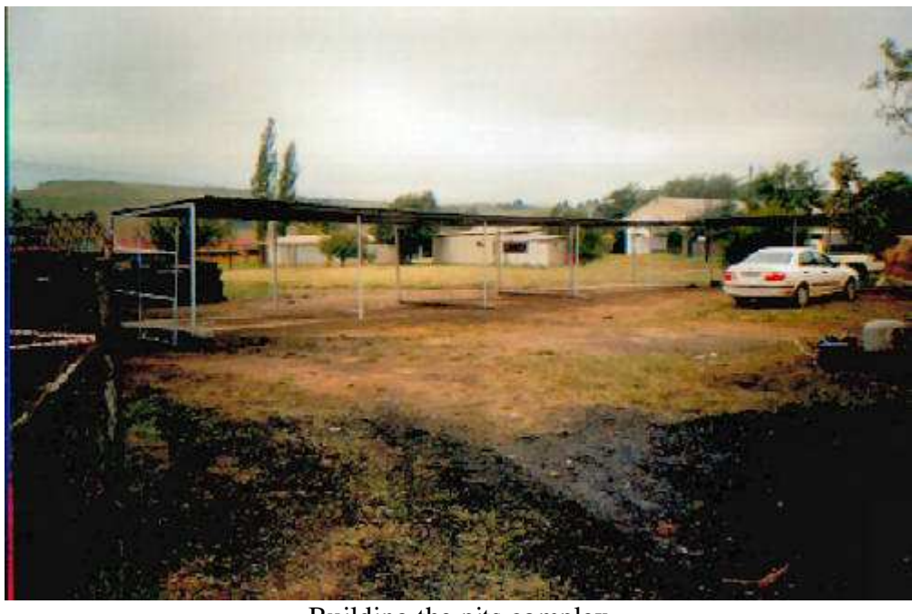
Building the pits complex