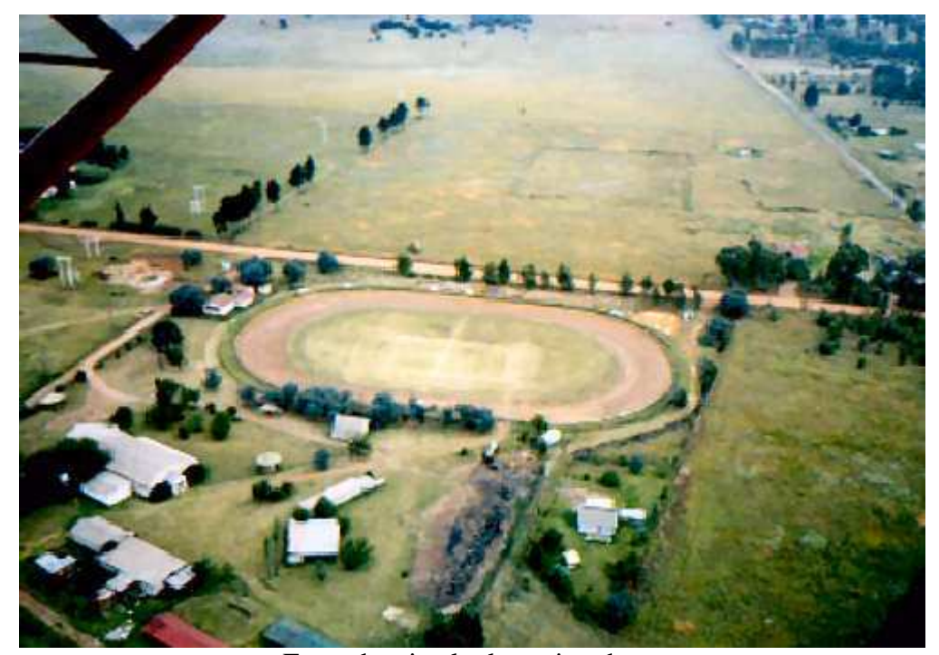
From the air - looks a nice shape