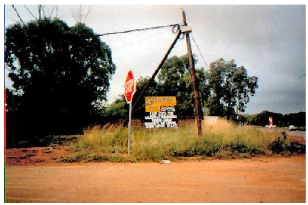
Hardly the most auspicious of entrances to the stadium!