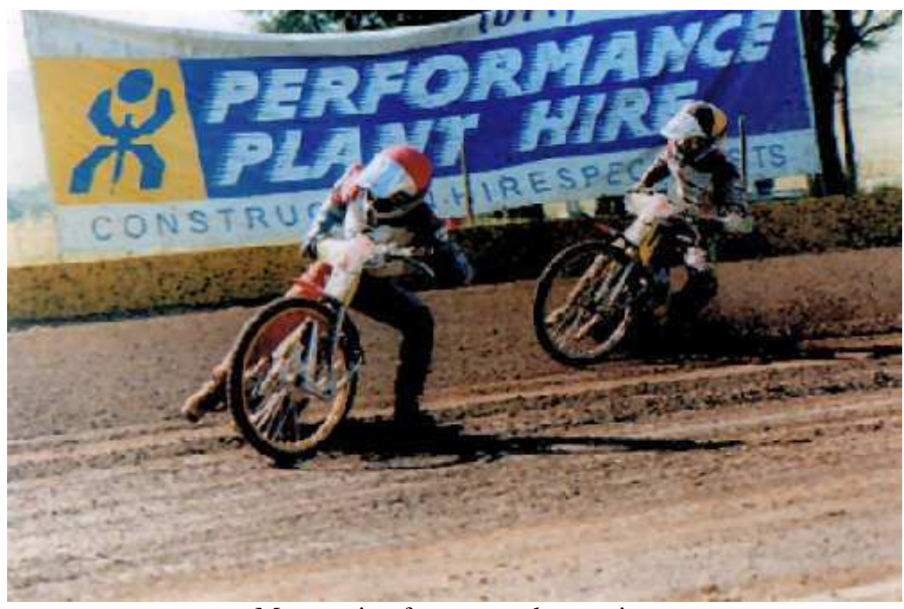
More action from an early meeting