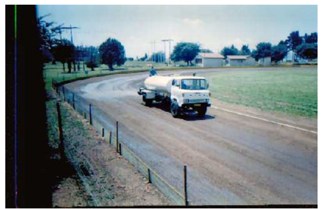
Literally weeks later and the place looks brilliant