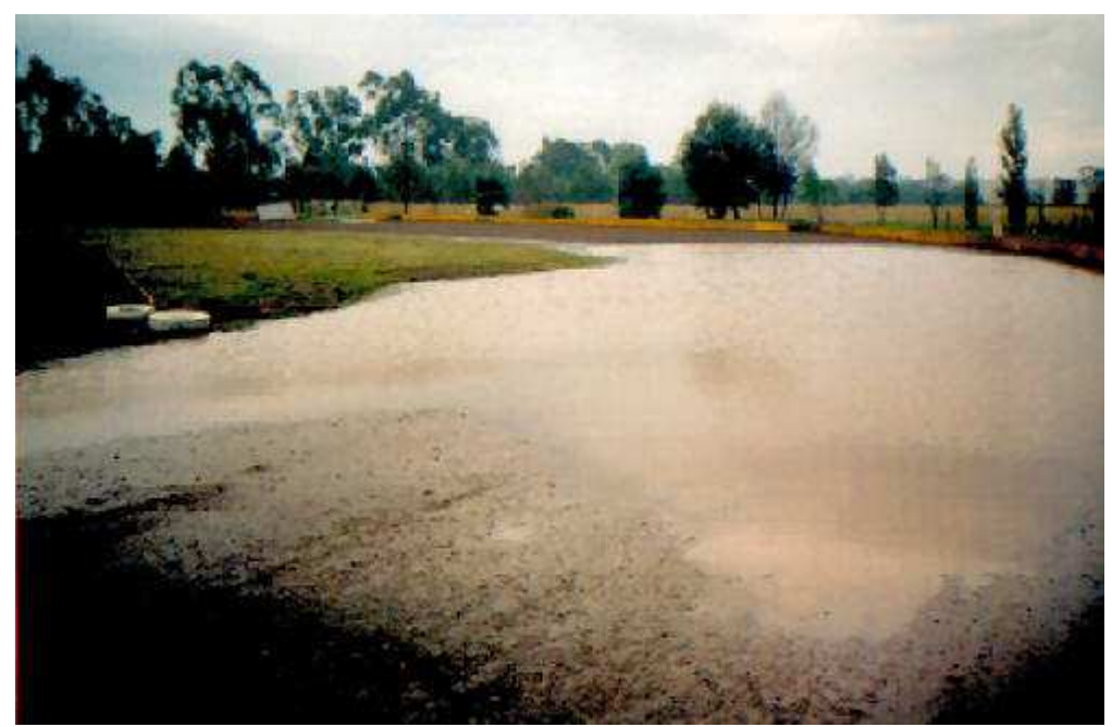
When it rains it really rains. This was the track first thing in the morning. Believe it or not, they actually pumped all this off and got the meeting on in the evening.