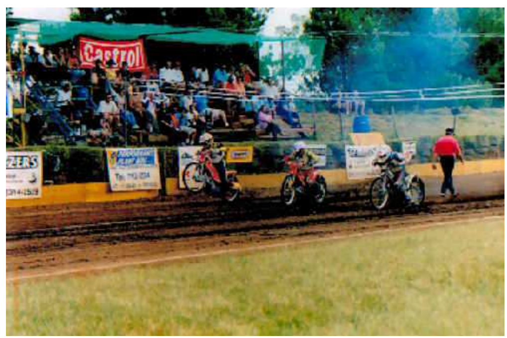
Loads of dirt on the track