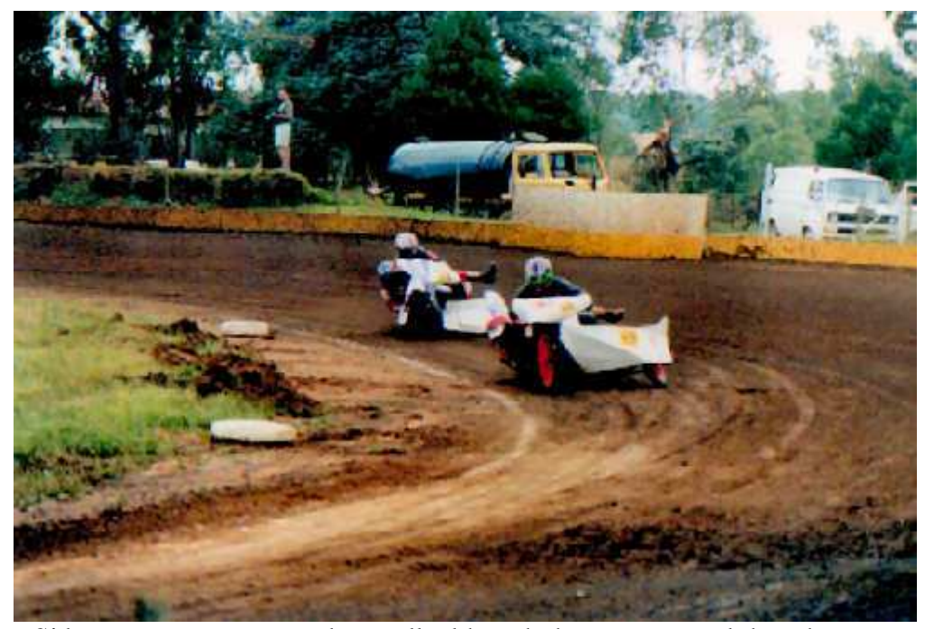
Sidecars were encouraged as well, although they went round the other way