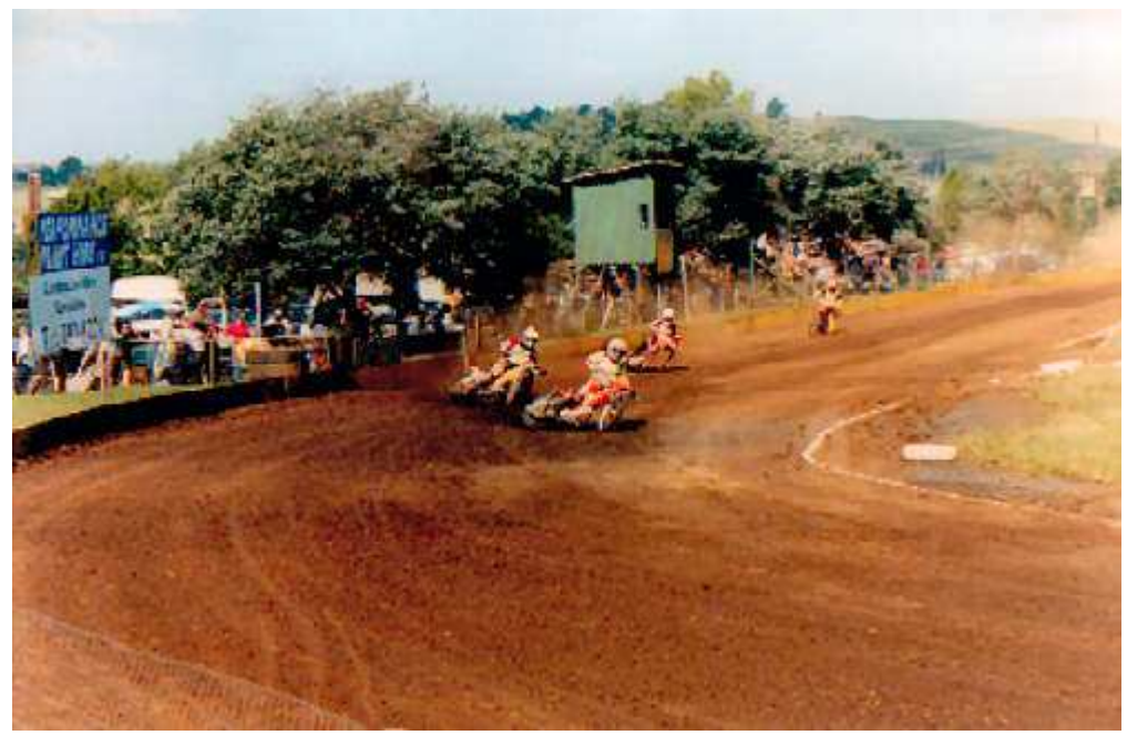
Action from one of the first meetings ever held at Walkerville