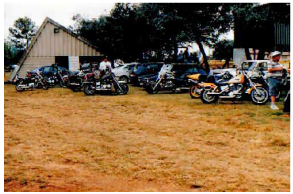
The car park was divided into cars and bikes. Bikers were encouraged to bring along their best bikes - these were then entered into a competition